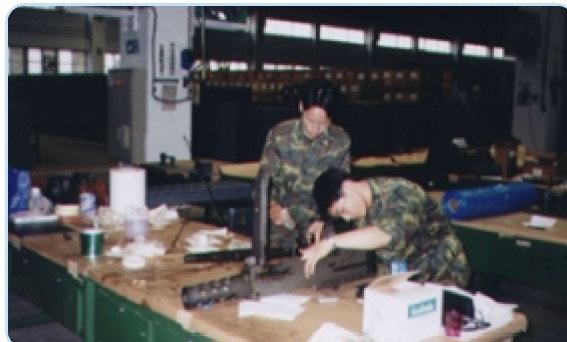
Cleaning and preparation of 0.5 caliber Brownings with Vapro 818 CLP before preservation.

Use Vapro VCI-818 CLP for the cleaning of small arms, automatic weapons, howitzers, battle tank's gun barrel, naval and aircraft weapons before and after firing for optimum corrosion protection.