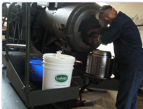
Cleaning of Howitzer Gun Barrel with Vapro 818 CLP.