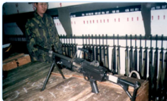
Cleaning of GPMG (General Purpose Machine Gun) with Vapro VCI-818 CLP.