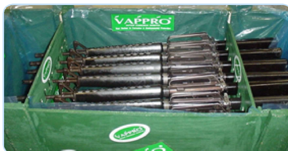
Cleaning and preservation of M16s using Vapro VCI-818 CLP.