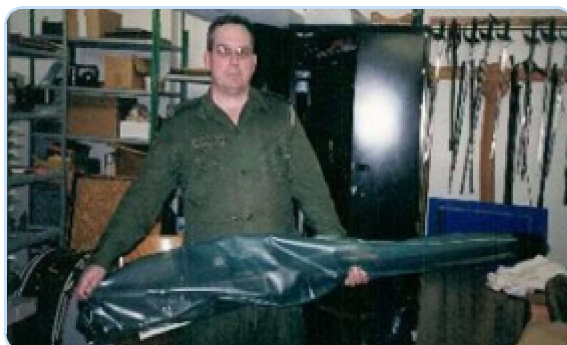
A preserved 0.5 mm Browning M2 Machine Gun after cleaning with Vapro VCI-818 CLP and Arm-Gard.